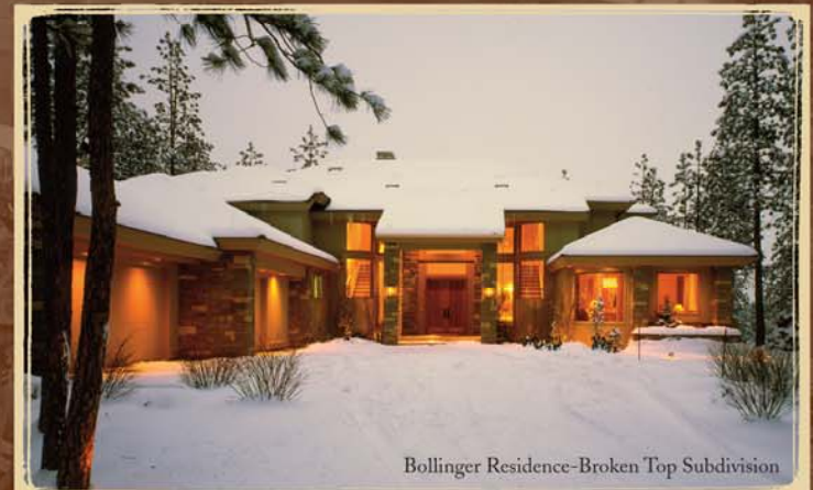
Bollinger Residence-Broken Top Subdivision