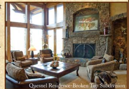
Quesnel Residence-Broken Top Subdivision