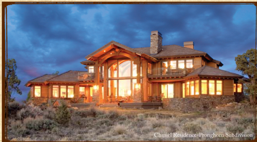
Chmiel Residence-Pronghorn Subdivision

For over 40 years, JELD-WEN has crafted beautiful windows and doors that remain durable, secure and energy-efficient. Steve Madsen Homes utilizes the beauty of Jeld-Wen to create an inspired home that mirrors your own style.