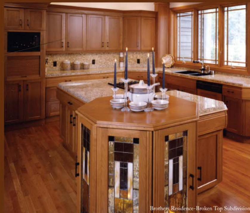
Brothers Residence-Broken Top Subdivision

With over 20 years of experience in the stone industry, Classique Marble & Granite, Inc., has been a full-service marble and granite fabricator in Oregon. Specializing in natural stone slab fabrication, installation and maintenance, they offer superior products, exceptional work and competitive pricing to fit their client's budget each and every time. Fine homebuilders, designers and architects choose them for their state-of-the-art fabrication equipment, which produces the highest-quality products for every stage of their projects. From construction to design to installation, Madsen Homes knows Classique Marble & Granite, Inc., is the one to call.