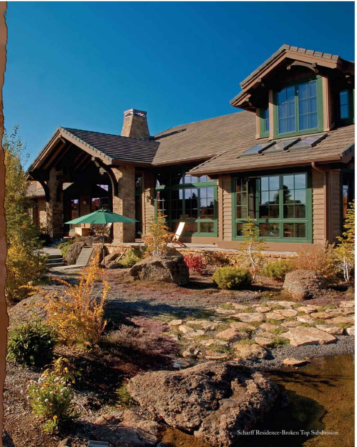
Scharff Residence-Broken Top Subdivision