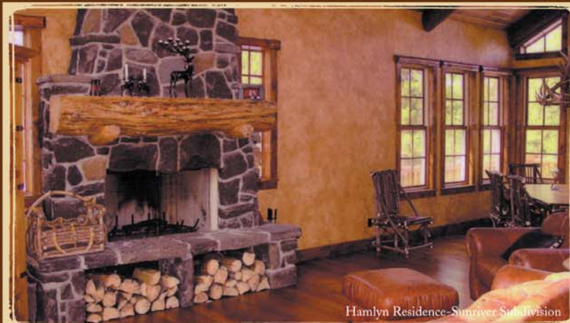
Hamlyn Residence-Sunriver Subdivision

19566 SW Brookside Way • Bend, OR 97702 • 541.388.9210