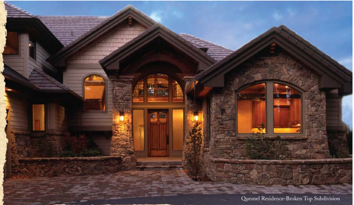
Quesnel Residence-Broken Top Subdivision

Backstrom BUILDERS CENTER BOISE Engineered Wood Products