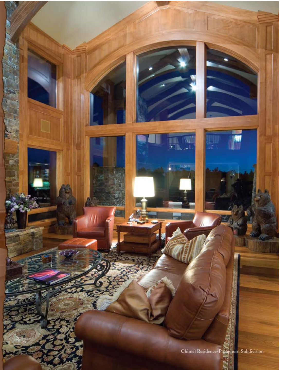
Chimel Residence-Pronghorn Subdivision