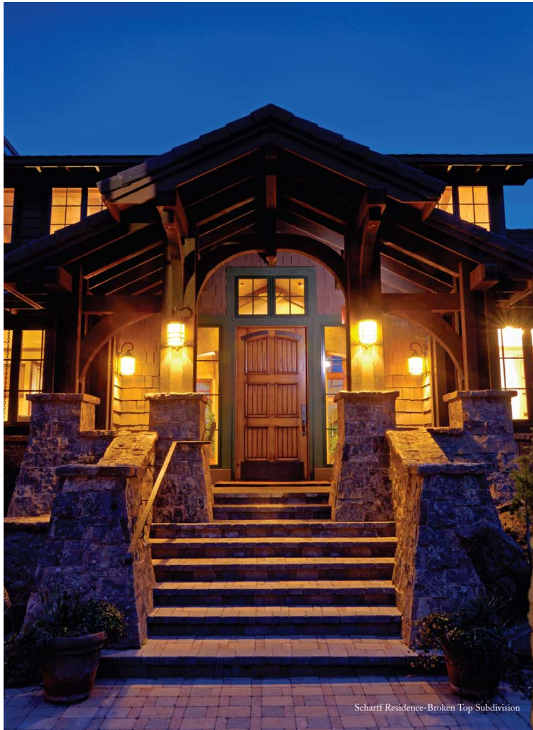
Scharff Residence-Broken Top Subdivision