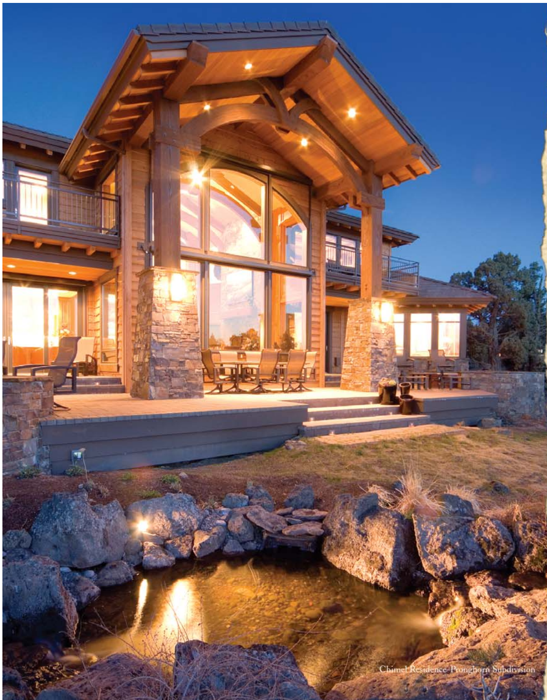
Chimel Residence- Pronghorn Subdivision